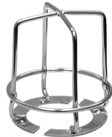
Dry Sprinkler Guard (Order sprinkler guard separately from sprinklers.)