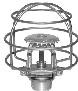
Model D-1 Sprinkler Guard on Upright and Pendent Frame-Style Sprinklers*